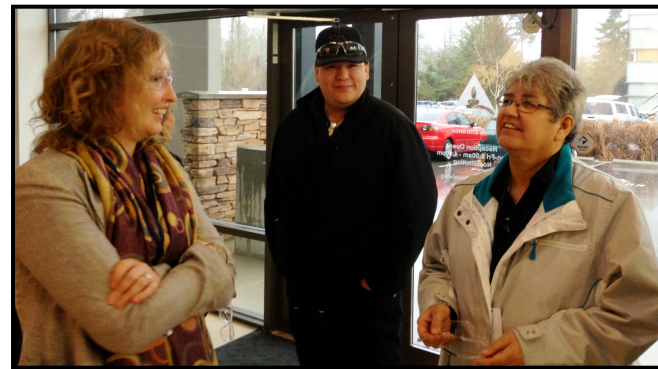
Top: Fire Assay at ALS Minerals.